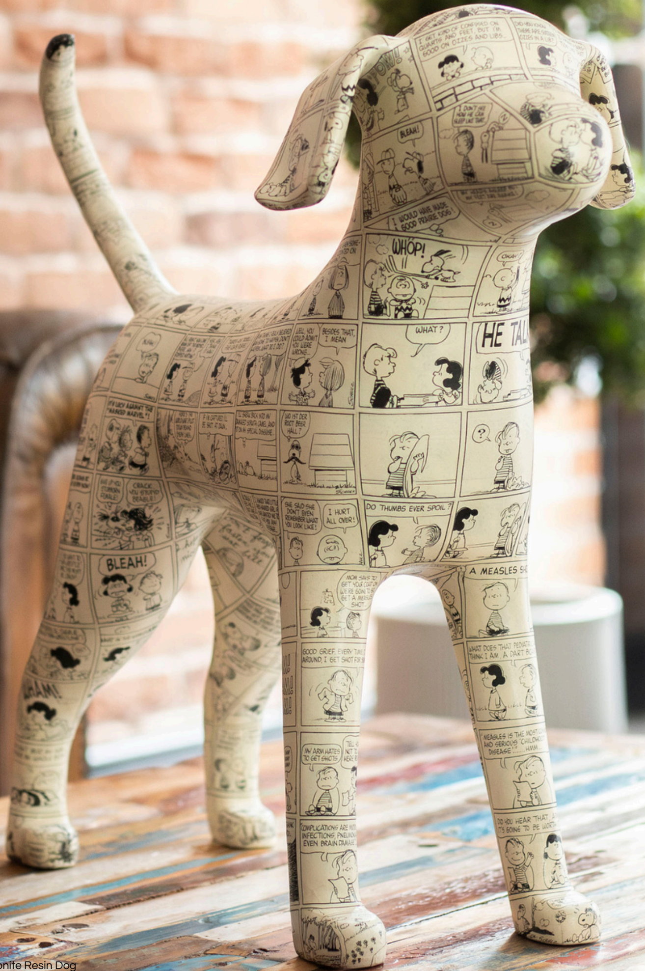
Schroeder Original Jesmonite Resin Dog Sculpture Size - L 46 x H 52 x W 20 cm